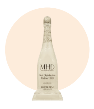
BEST DISTRIBUTION PARTNER 2021