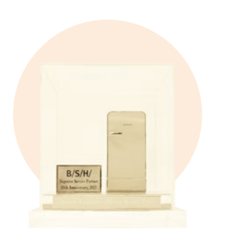
SUPERIOR SERVICE PARTNER AWARD 2021