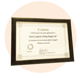
APPRECIATION AWARD FOR INCESSANT EFFORT & SUPPORT