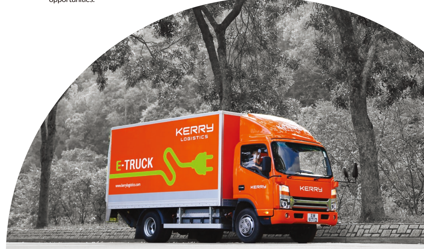
In May 2022, KLN Group became the first logistics company to deploy electric trucks in Hong Kong.

To enhance KLN Group's air freight capacity and last-mile delivery capabilities, KLN Group is expanding its own-controlled air freight network and seeking new business potentials with S.F. Airlines by developing new products, services and trade routes. KLN Group's cross-border express network in Southeast Asia has also gained ground. The synergies thus created are further increasing KLN Group's competitiveness and diversity of global solutions it offers across the region.