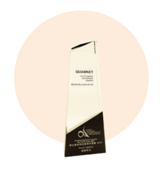
OUTSTANDING GREEN LOGISTICS SERVICE PROVIDER

QUAMNET OUTSTANDING ENTERPRISE AWARDS 2022