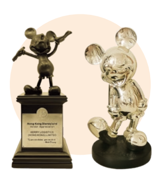
VENDOR APPRECIATION HONG KONG DISNEYLAND BEST SERVICE AWARD