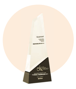
OUTSTANDING GLOBAL 3PL

QUAMNET OUTSTANDING ENTERPRISE AWARDS 2021