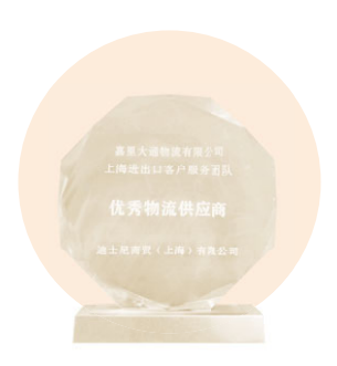
OUTSTANDING LOGISTICS PROVIDER 2021