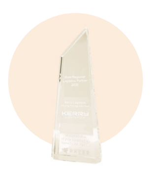
BEST REGIONAL LOGISTICS PARTNER 2020