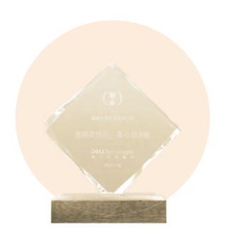
PANDEMIC-CONTROL CONTRIBUTION AWARD 2021