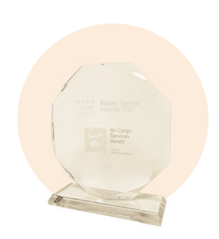
AIR CARGO SERVICES AWARD