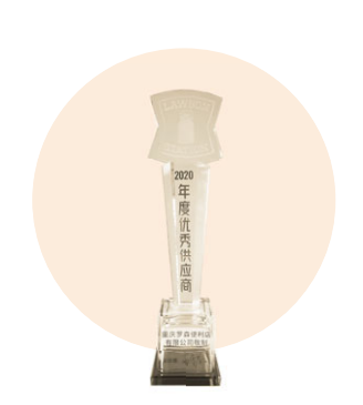
EXCELLENT PROVIDER 2020