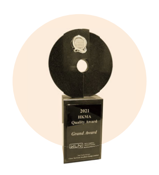
HKMA QUALITY AWARD -GRAND AWARD