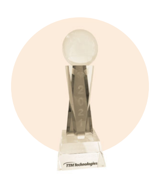
GLOBAL SUPPLIER MANAGEMENT AWARD 2021